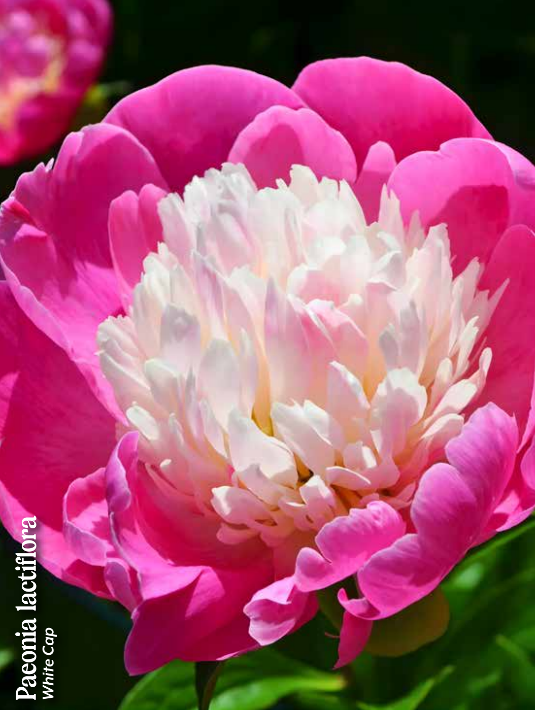
Paeonia lactiflora White Cap