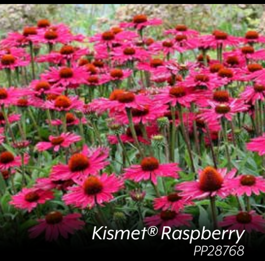
Kismet® Raspberry PP28768