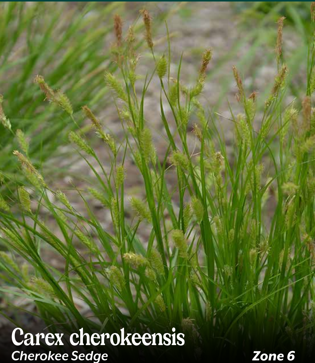
Carex cherokeensis Cherokee Sedge