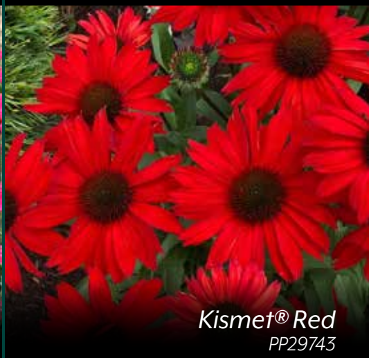
Kismet® Red PP29743