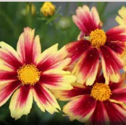
Leading Lady™ Iron Lady

In 2024, we introduced Coreopsis Leading Lady™ Charlize, named after Charlize Theron. We were impressed with the bright, vivid color and exceptional long bloom time. In 2026, we are thrilled to introduce more exciting varieties to complete the Leading Lady™ Coreopsis collection. Leading Lady™ Lauren, named after Lauren Bacall; stuns with golden eyes, true yellow petals and emerald green foliage. Leading Lady™ Iron Lady, named after Margret Thatcher; boldly stands with bright yellow-orange bicolored flowers. Leading Lady™ Sophia, named after Sophia Loren; radiates with masses of large, showy flowers all summer long. These Coreopsis are all early flowering with extreme heat and humidity tolerance. Sure to impress in any garden or landscape!