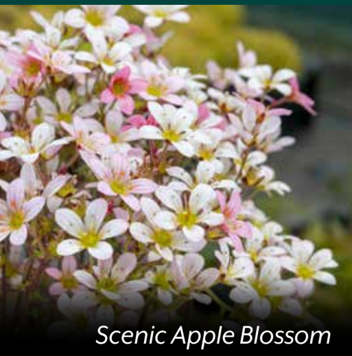
Scenic Apple Blossom