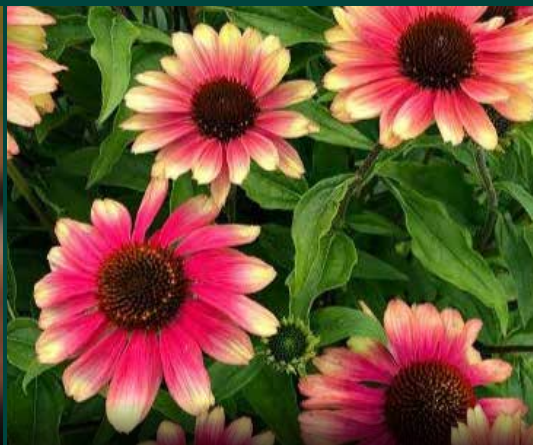
Kismet® Pink Lemonade PPAF