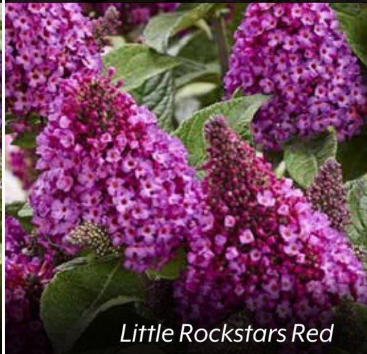
Little Rockstars Red