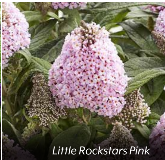
Little Rockstars Pink