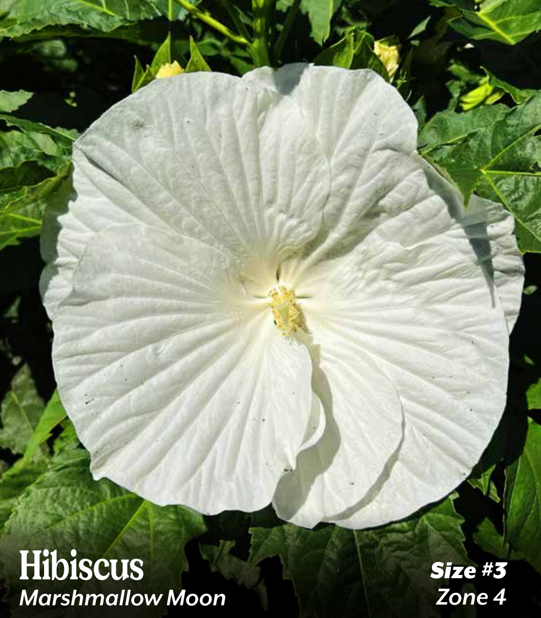
Hibiscus Marshmallow Moon