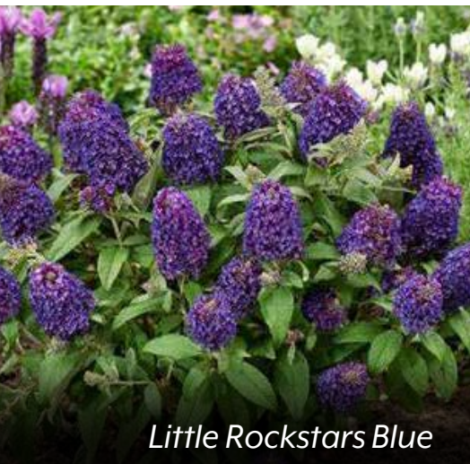
Little Rockstars Blue