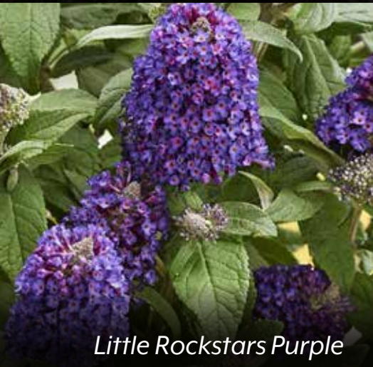
Little Rockstars Purple